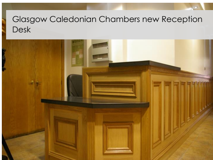
Glasgow Caledonian Chambers new Reception Desk