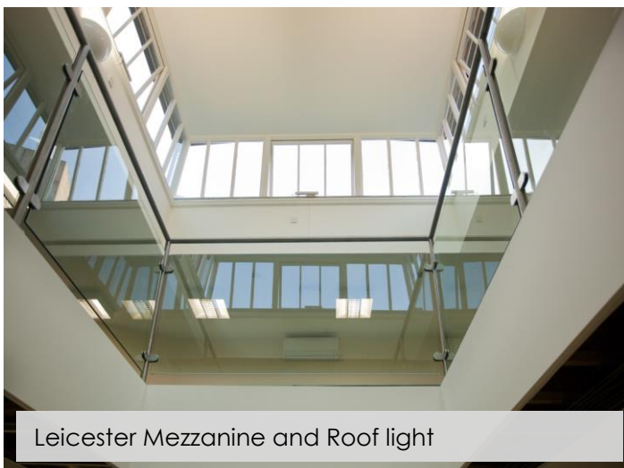
Leicester Mezzanine and Roof light