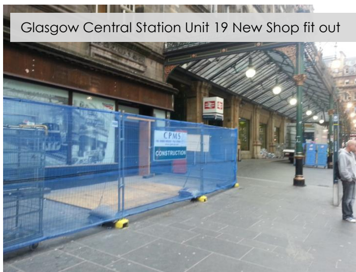
Glasgow Central Station Unit 19 New Shop fit out