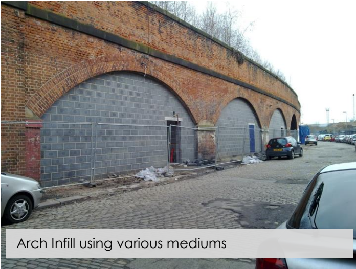
Arch Infill using various mediums

Commercial Property Maintenance Services Ltd