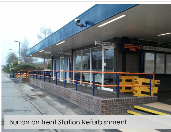
Burton on Trent Station Refurbishment