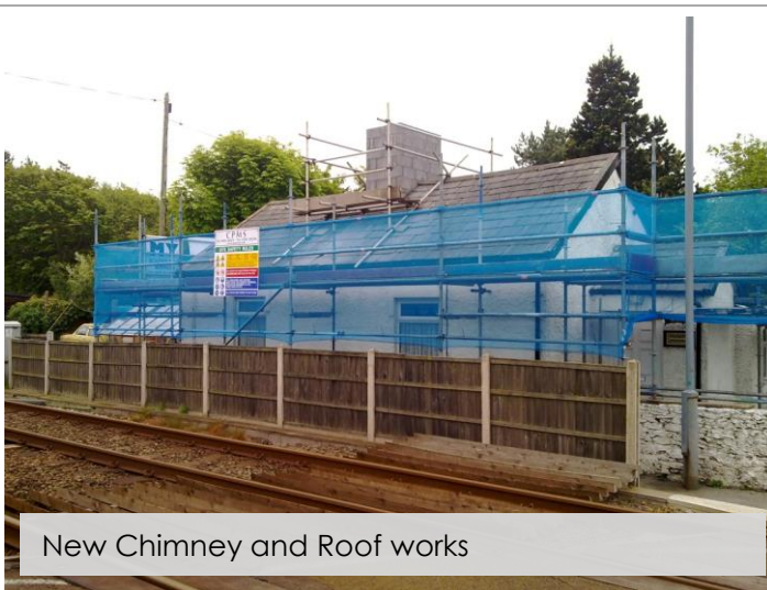
New Chimney and Roof works