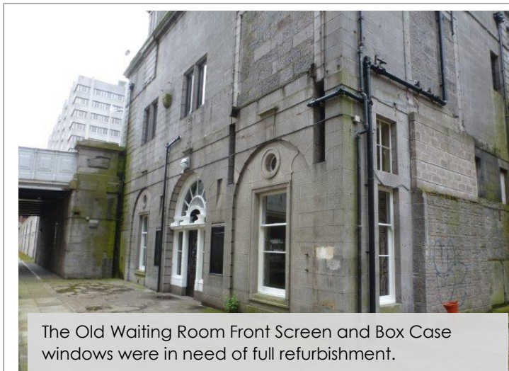
The Old Waiting Room Front Screen and Box Case windows were in need of full refurbishment.