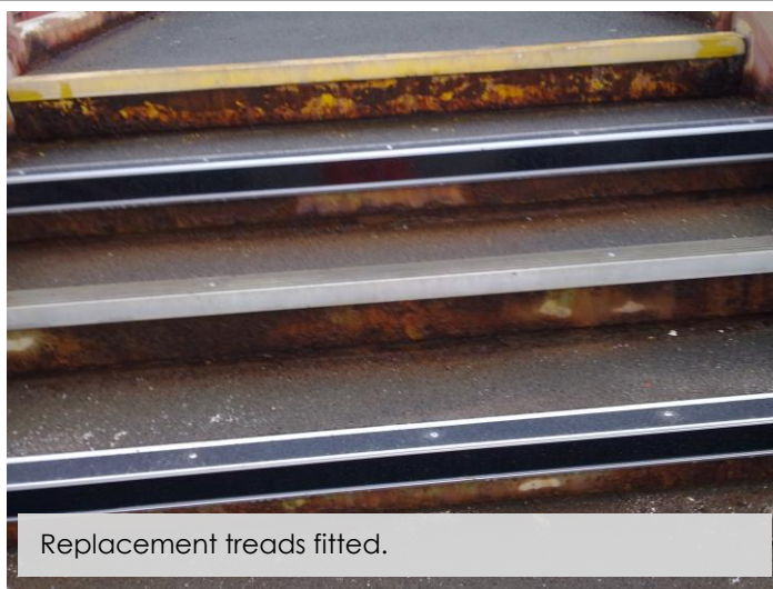
Replacement treads fitted.