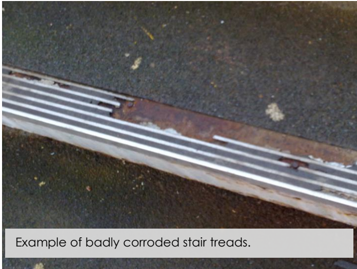
Example of badly corroded stair treads.