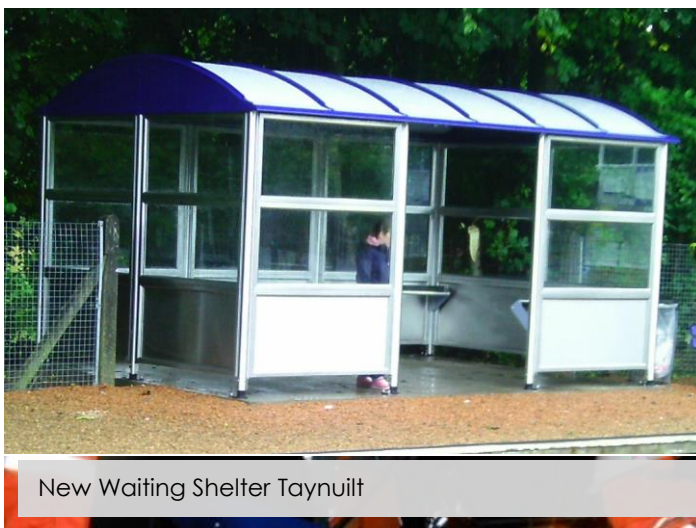
New Waiting Shelter Taynuilt