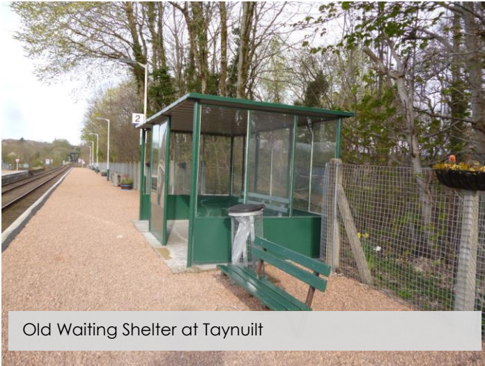
Old Waiting Shelter at Taynuilt

Commercial Property Maintenance Services Ltd