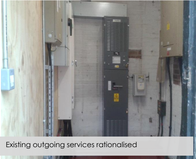
Existing outgoing services rationalised

Commercial Property Maintenance Services Ltd