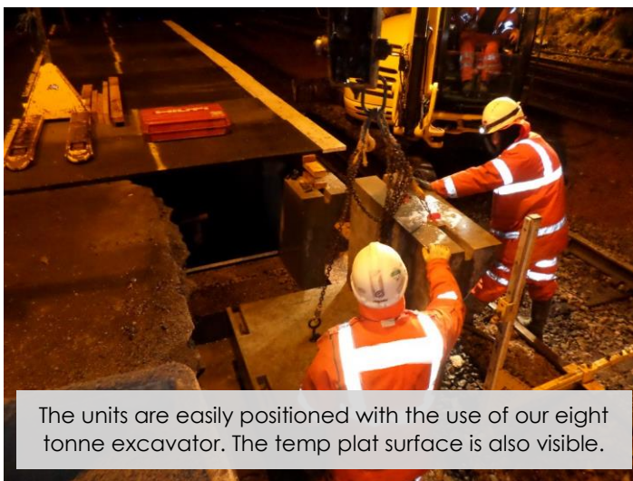
The units are easily positioned with the use of our eight tonne excavator. The temp plat surface is also visible.

The project involved the installation of precast concrete retaining wall units, with built in oversail and mechanical bond to replace a traditional build. The platform was returned to operational status after each shift.