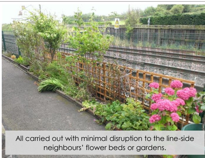
All carried out with minimal disruption to the line-side neighbours' flower beds or gardens.