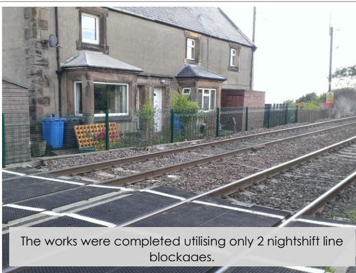
The works were completed utilising only 2 nightshift line blockades.