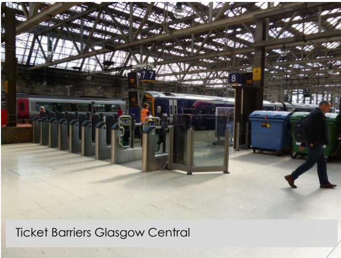
Ticket Barriers Glasgow Central

Commercial Property Maintenance Services Ltd