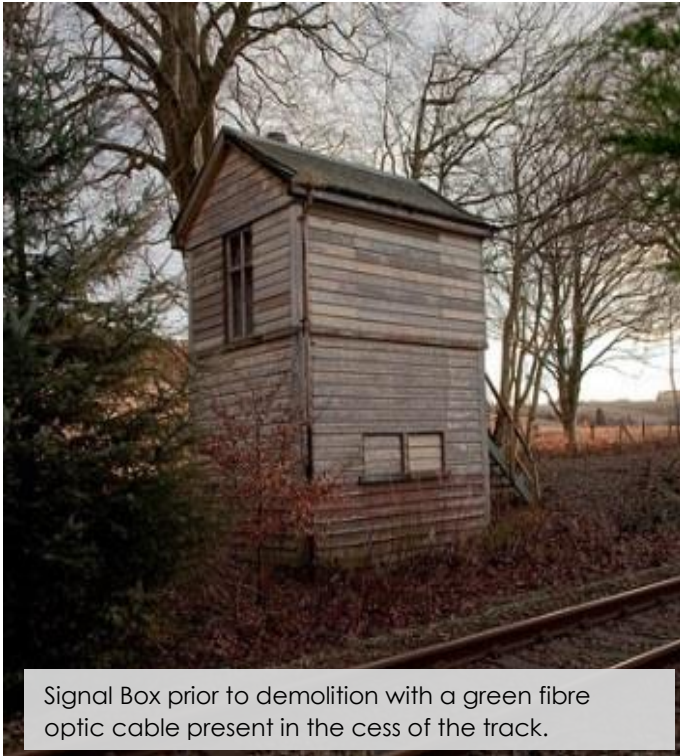
Signal Box prior to demolition with a green fibre optic cable present in the cess of the track.

Delivered with minimal disturbance to line side neighbours or wildlife.