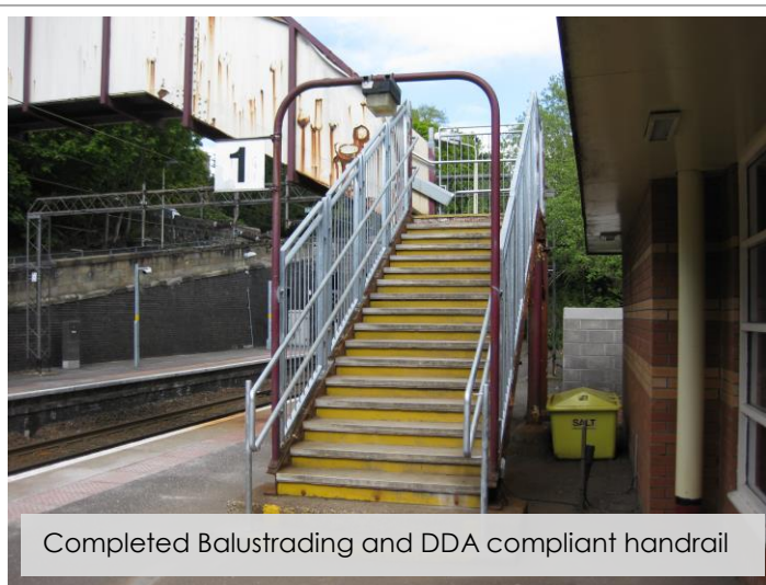
Completed Balustrading and DDA compliant handrail