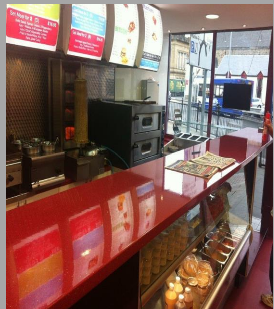
Front counter area after hand-back.

The work was completed on time and budget with no issues.