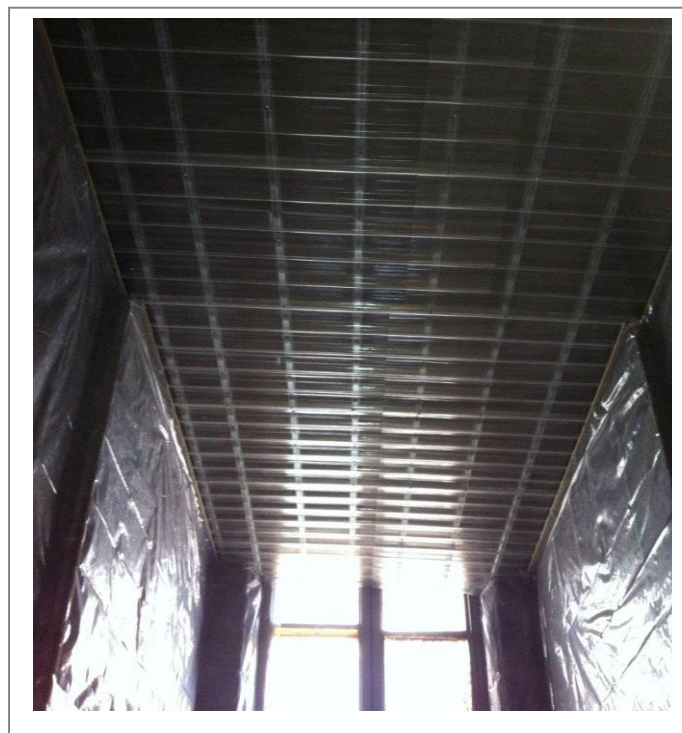
Fylon sheeting fitted to the Upper roof area to prevent water ingress which will prevent future problems to the tenant.